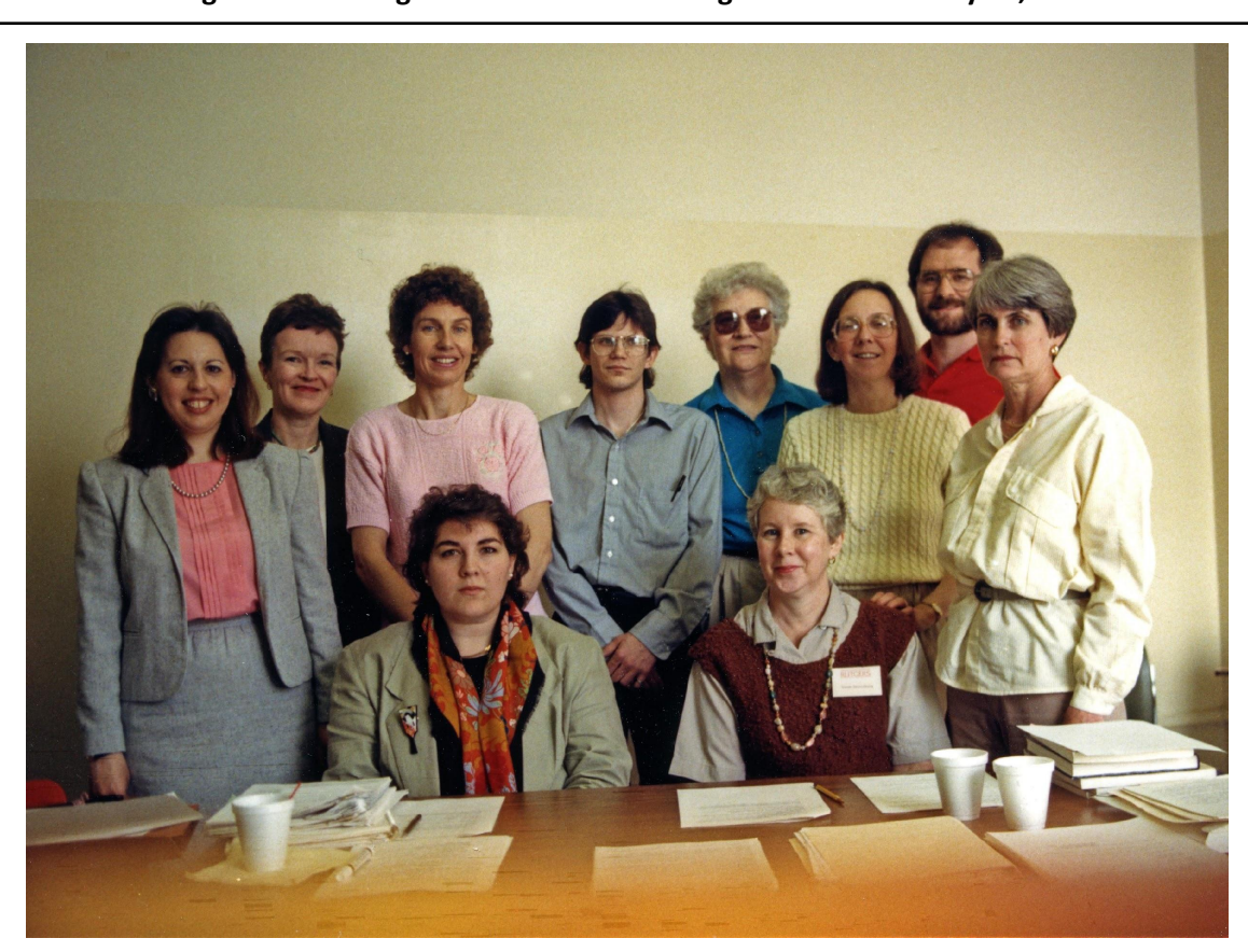
Rutgers SCILS inaugural Preservation Management Course May 19, 1989