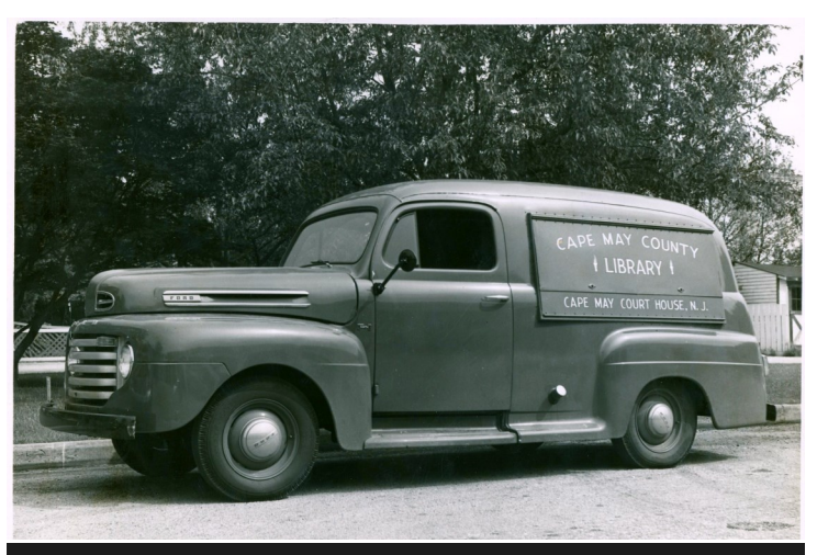
Bookmobile c. 1940