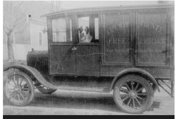
Bookmobile with Dog c. 1920

Unfortunately, there are gaps in our bookmobile's history. There is simply no information on whether or not a bookmobile or library truck was in service in the 1930s and 1940s; during this time, library buildings were being erected and "stations" began to close down. We have photos indicating that a bookmobile was again used in the 1950s, this time a 1948 Ford Panel F-1 Truck. In the late 1970s the library used a converted bread truck, and in the 1990s it looked much like a converted camper. In 2007, CMCL purchased a custom bookmobile that included a wheelchair-accessible entrance. After the '07 bookmobile broke down in 2015, a new bookmobile was purchased on July 13<sup>th</sup> 2015, and continues to be used today. The current bookmobile weighs 12,500 pounds and carries around 2,000 books and DVDs to designated stops throughout the county. The stops include post offices, daycares, the Coast Guard base, primary and elementary schools, senior centers, and community centers. We also take the bookmobile to local fairs, festivals, parades, and special events!